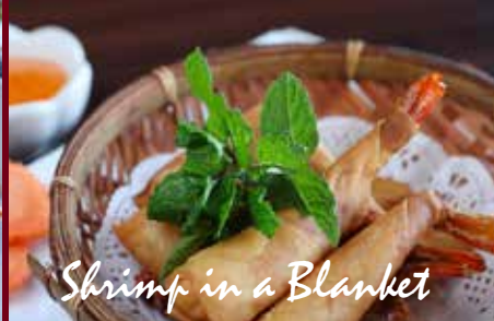
Shrimp in a Blanket