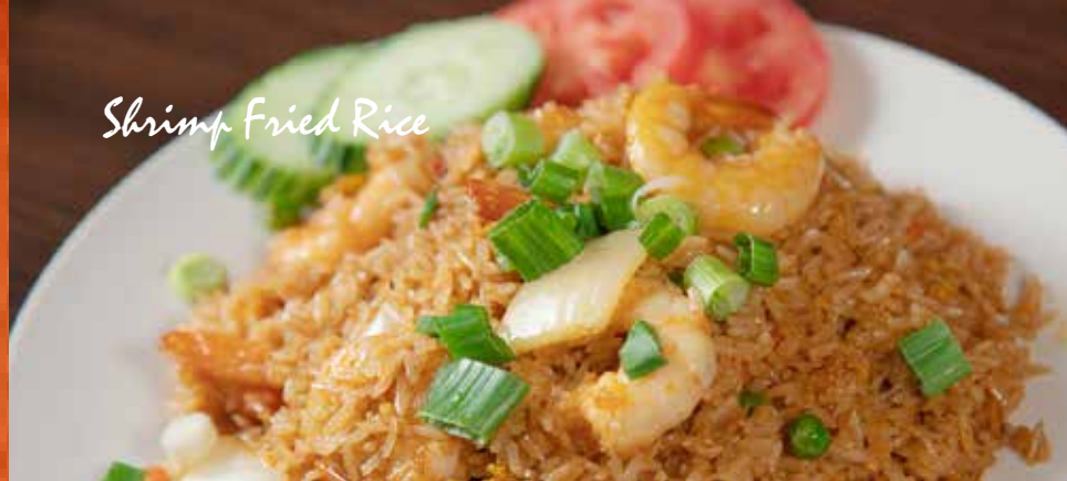
Shrimp Fried Rice