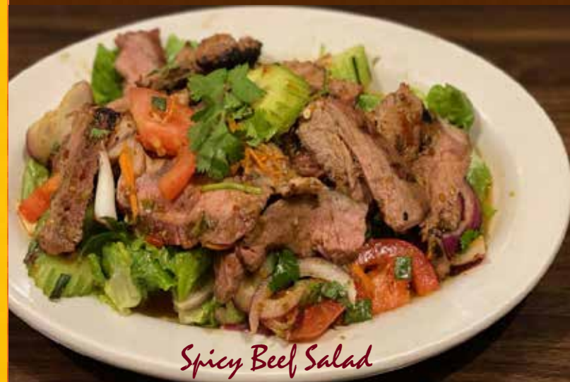
Spicy Beef Salad