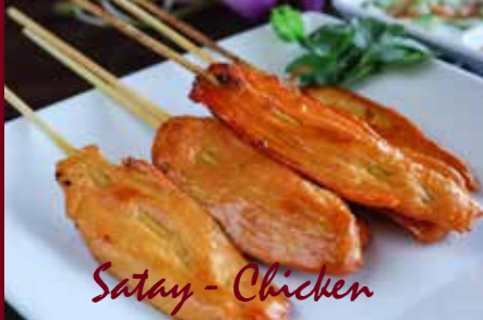
Satay - Chicken