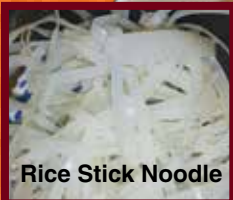
Rice Stick Noodle