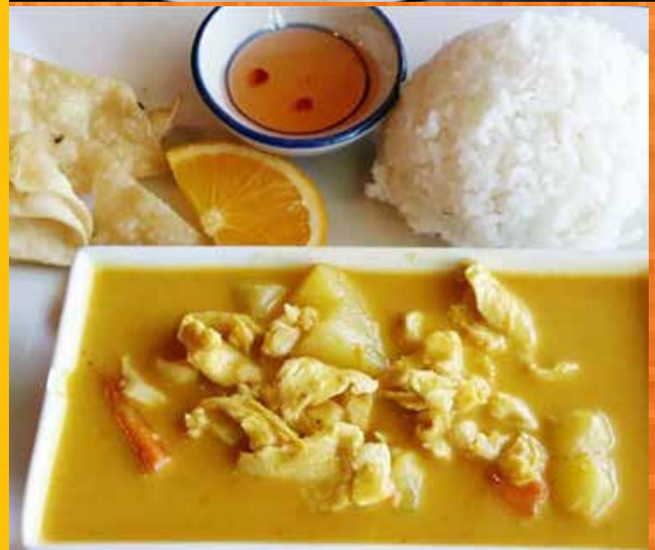
Ka ree Kai (Yellow Curry)

These dishes are prepared medium spicy, please notify your server how spicy you prefer your dish.