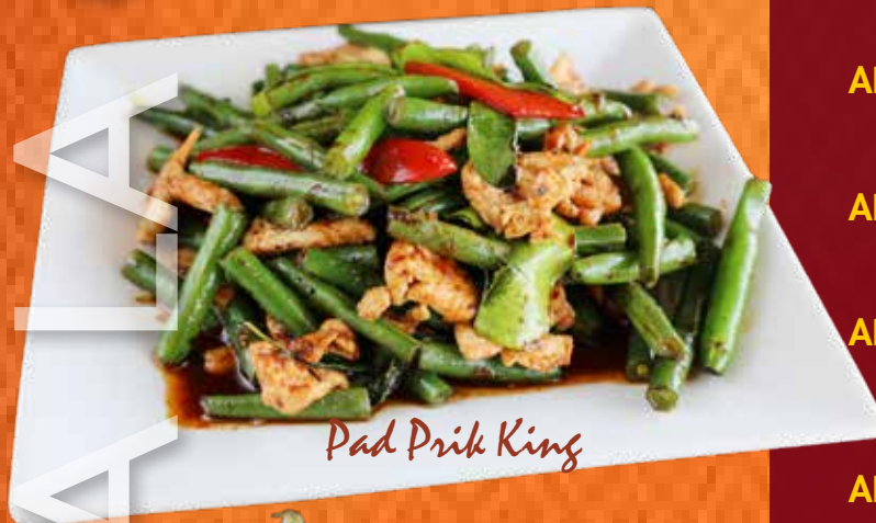
Pad Prik King