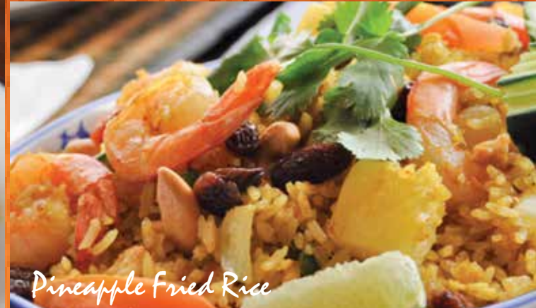
Pineapple Fried Rice