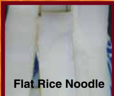
Flat Rice Noodle