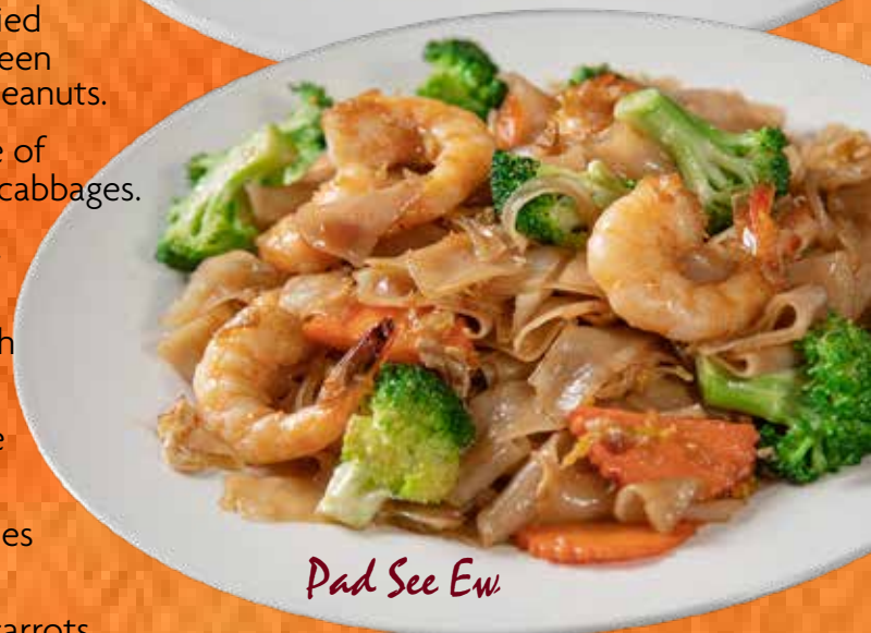
Pad See Ew