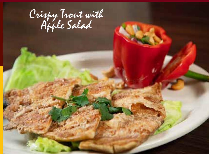
Crispy Trout with Apple Salad

All items served with steamed rice 8 Oz. (no substitution)